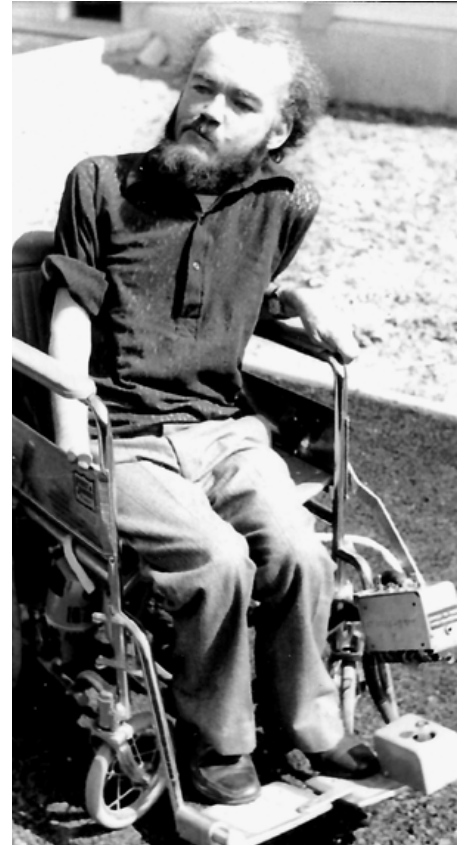
Christy Brown, foot painter from Ireland, became world-famous through his book "My Left Foot", which was filmed.

His autobiography "My Left Foot", published in 1954, was filmed, making it famous worldwide. Daniel Day-Lewis