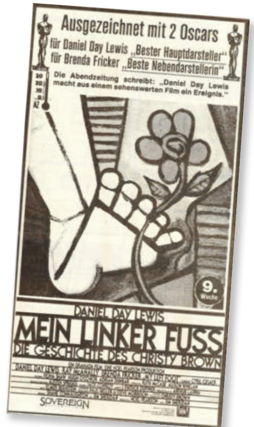
Advertising for the film “My Left Foot”, which won two Oscars.

“My Left Foot” is more than a biopic – it is a tribute to human willpower and the transformative power of art. The film shows the struggles of people with disabilities and, at the same time, illuminates the significance of family, community and individual determination. With a sharp-witted script, strong characters and authentic production, it is moving at the deepest level and inspires viewers to redefine the boundaries of the possible, time and again. An indispensable work for everyone who wishes to be inspired by stories about extraordinary personalities.