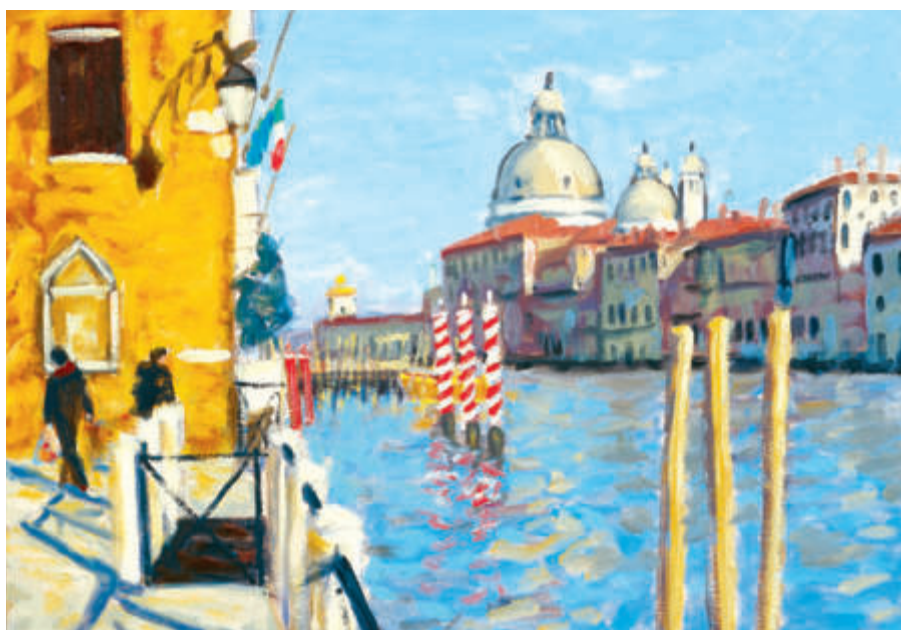
"Santa Maria della Salute", oils, 50 × 60 cm.

My artistic journey: a message from one artist to another.