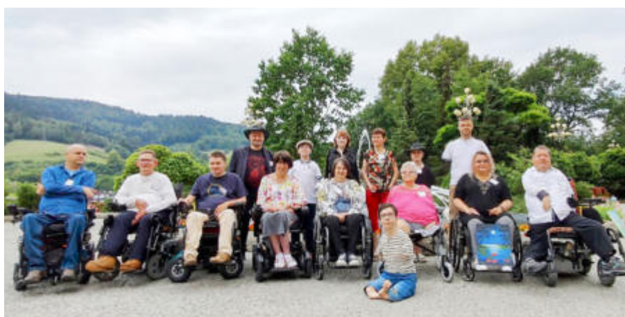
The mouth and foot painters of Poland who participated in the workshop.

The theme of the workshop, led by artist Mariusz Drohomirecki, could be chosen freely. Artists allowed themselves to be inspired by the world around them. The mouth and foot painters set to work with commitment and great motivation. It was a pleasure to see the concentration with which the participants approached their task. The course tutor provided the artists with much valuable advice, which they were able to apply to their work.