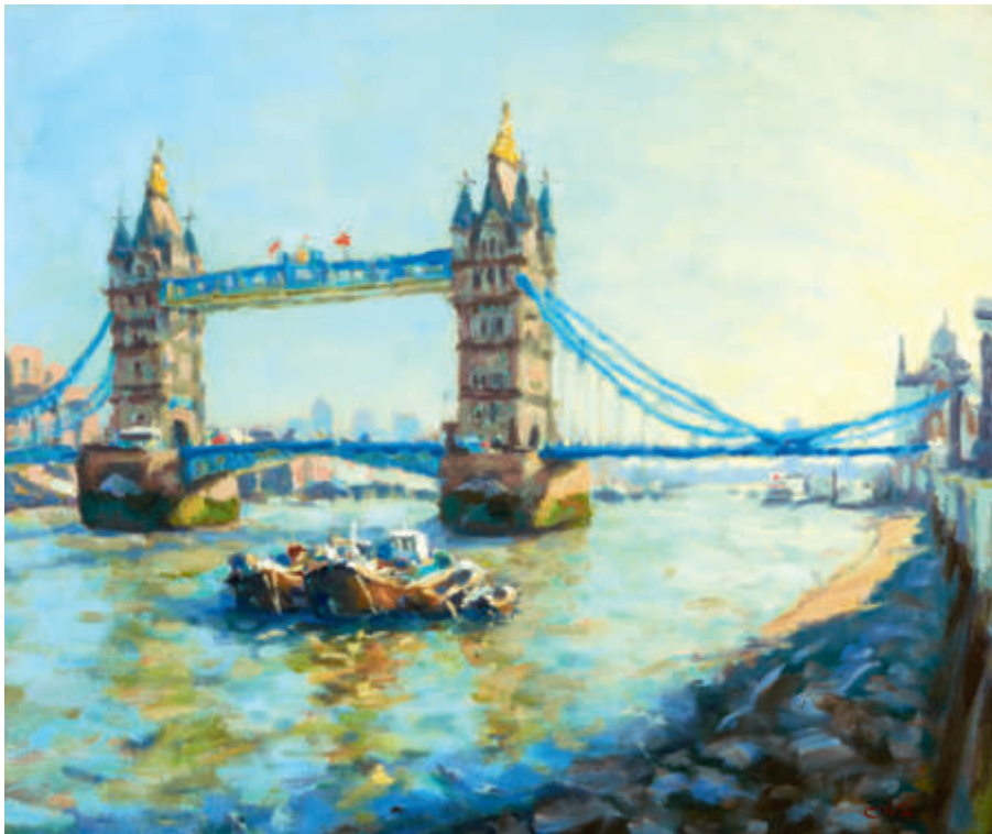
"Tower Bridge, distant docklands", oils, 51 × 61 cm.

Art gives us the power to break down barriers, not just for ourselves, but for others who see our work. When people view my paintings, I want them to see more than just the images on the canvas. I want them to see the determination and passion behind every stroke. I want to challenge the stereotypes of what disabled people are capable of and inspire others to do the same. For me, painting has been my therapy. Each time I pick up the brush, I'm not just painting a picture, I'm painting a piece of me.