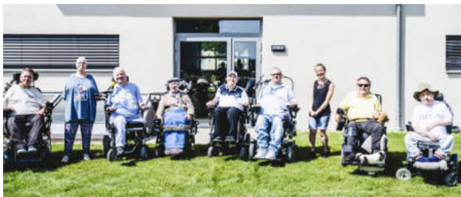
The participants of the workshop of the Germany publishing house.

From 29 to 31 August 2024, 18 British mouth and foot painters met for a