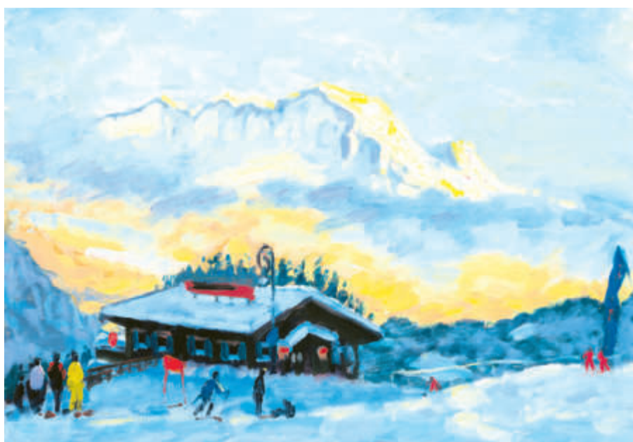
"Sunset, Chaîne d'Arvais", oils, 50 × 60 cm.