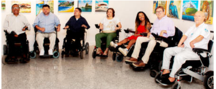
The mouth and foot painters from Brazil participating in the opening of the special exhibition.