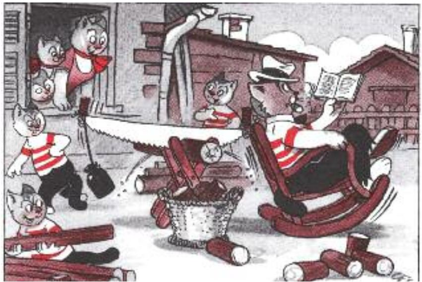
'Oskar saws wood' is the title of this caricature.