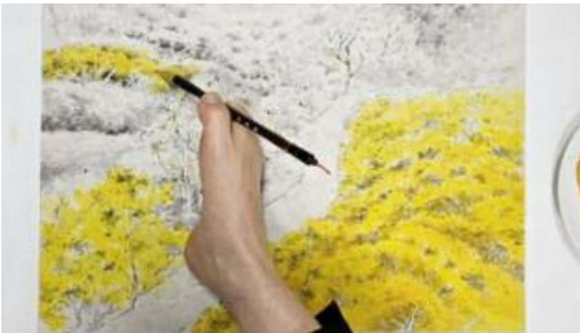
Colour the petals in light to strong yellow to depict the various layers of the blossom.