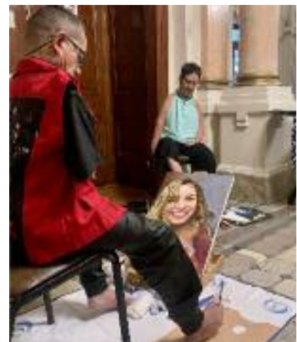
The attending artists also gave painting demonstrations, which were met with great interest.