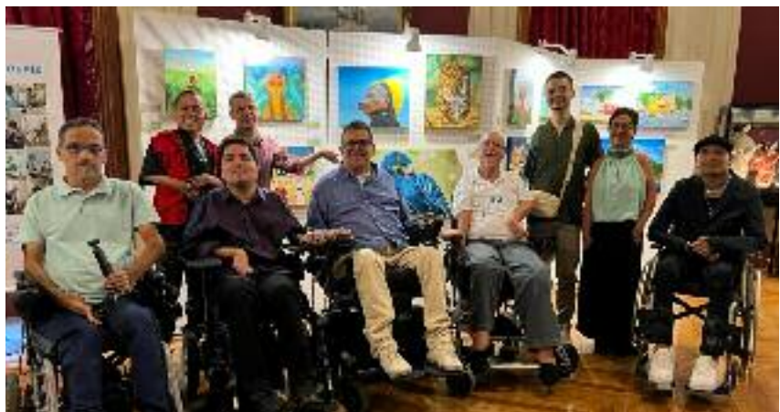
The spirit among the artists present was excellent, especially given the great success of the exhibition.