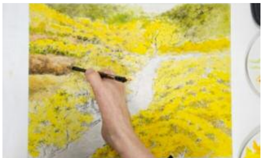
Accentuate the strong yellow in some parts and depict the entire yellow blossom.