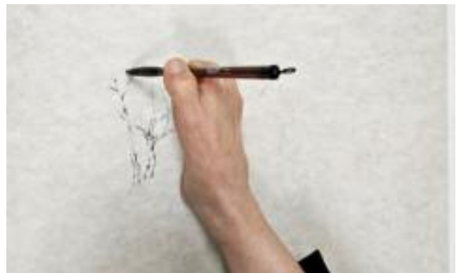
In Indian ink, draw the Cornelian cherry blossom tree to be depicted in detail.