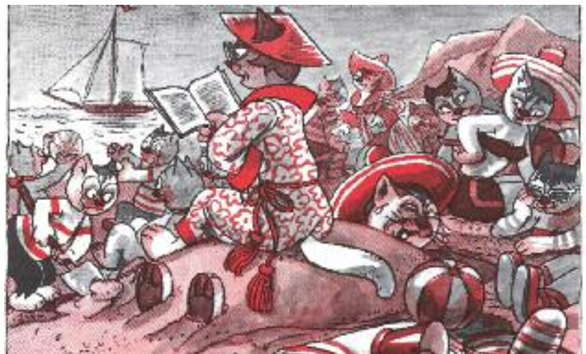
'Preventive detention' is the name of this caricature.