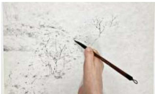
Draw the trees around the tree in the centre densely in some places and sparsely (or indistinctly) in others.