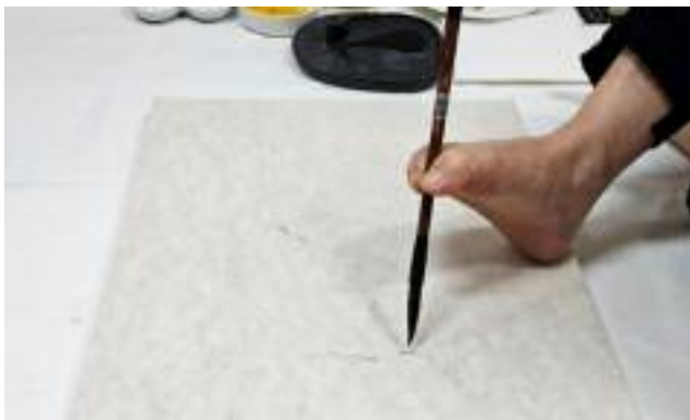
Establish the structure, the theme and the main area to be described.