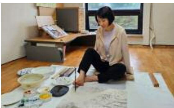
Draw in the road in the centre and the trees at the lower edge of the picture in Indian ink.