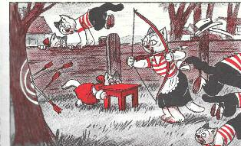
Mouth painter Cefischer gave this caricature the name 'Mother wants to shoot too'.