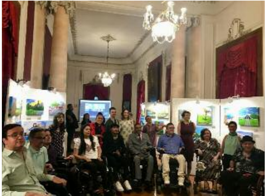
The mouth and foot painters of Brazil at the group exhibition.